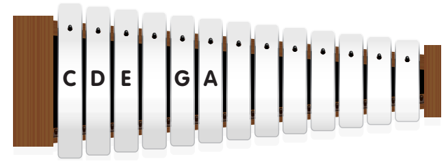
A pentatonic scale starting on the note C

A five-note scale Latin word 'penta' meaning 5 Latin word 'tonus' meaning sound