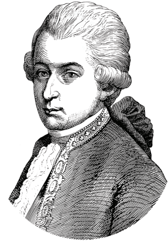
Wolfgang Amadeus Mozart 1756 - 1791

In this unit you will be composing music using the form Theme and variation.